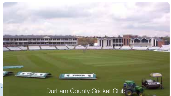
Durham County Cricket Club