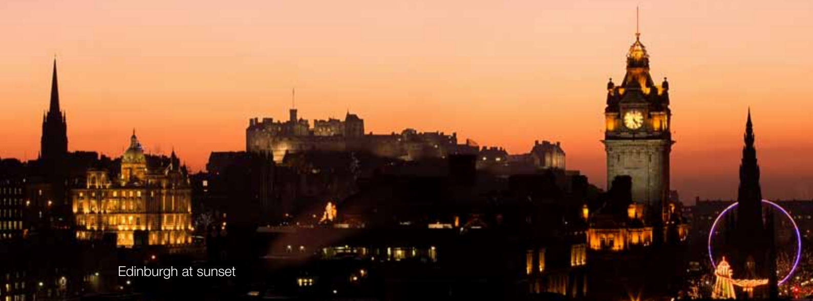
Edinburgh at sunset