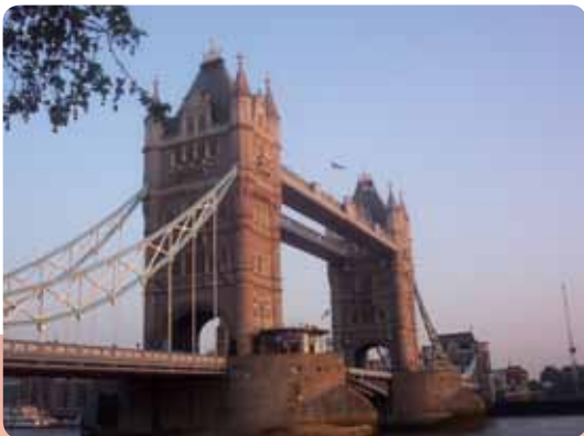
London's Tower Bridge