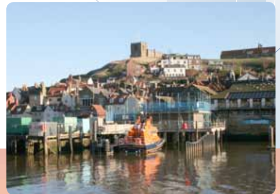
Whitby - Fishing Port