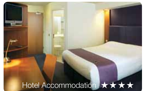
Hotel Accommodation ★★★★★

Upon arrival at Newcastle Airport, the tour group will be collected by minibus and taken to their accommodation in the heart of Durham City. The seventeen seat minibus will stay with the group throughout their time in England and will be used for travel for all trips and fixtures. Players will room together in pairs and breakfast is included as part of their visit. From their rooms they will have the opportunity to take the short walk into the city centre during their free time.